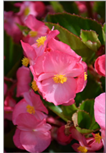
Big Pink Green Leaf Begonia flowers