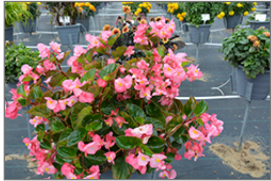
Big Pink Green Leaf Begonia in bloom

Big Pink Green Leaf Begonia will grow to be about 18 inches tall at maturity, with a spread of 18 inches. When grown in masses or used as a bedding plant, individual plants should be spaced approximately 14 inches apart. Its foliage tends to remain dense right to the ground, not requiring facer plants in front. Although it's not a true annual, this plant can be expected to behave as an annual in our climate if left outdoors over the winter, usually needing replacement the following year. As such, gardeners should take into consideration that it will perform differently than it would in its native habitat.