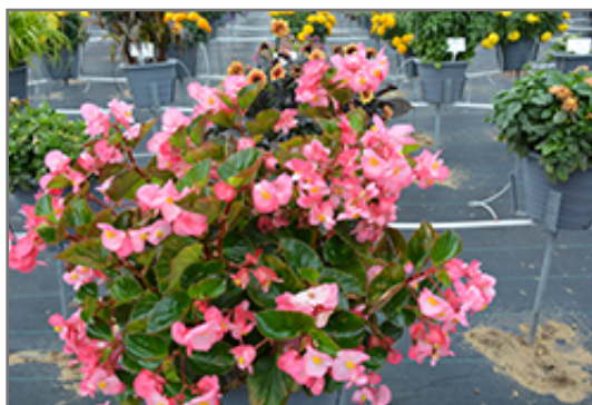
Big Pink Green Leaf Begonia in bloom

Big Pink Green Leaf Begonia is a fine choice for the garden, but it is also a good selection for planting in outdoor containers and hanging baskets. It is often used as a 'filler' in the 'spiller-thriller-filler' container combination, providing a mass of flowers and foliage against which the larger thriller plants stand out. Note that when growing plants in outdoor containers and baskets, they may require more frequent waterings than they would in the yard or garden.