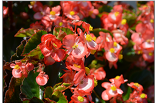
BabyWing Bicolor Begonia flowers