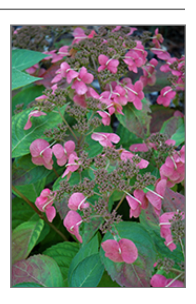
Twirligig Hydrangea flowers

Twirligig Hydrangea will grow to be about 3 feet tall at maturity, with a spread of 3 feet. It has a low canopy. It grows at a medium rate, and under ideal conditions can be expected to live for approximately 30 years.