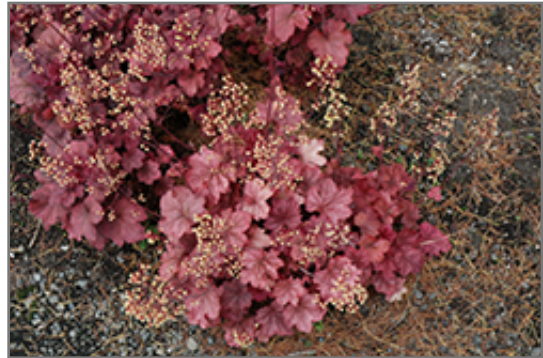
Root Beer Coral Bells in bloom

Root Beer Coral Bells will grow to be about 7 inches tall at maturity extending to 18 inches tall with the flowers, with a spread of 14 inches. When grown in masses or used as a bedding plant, individual plants should be spaced approximately 12 inches apart. Its foliage tends to remain low and dense right to the ground. It grows at a medium rate, and under ideal conditions can be expected to live for approximately 10 years. As an evergreen perennial, this plant will typically keep its form and foliage year-round.