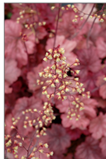
Root Beer Coral Bells flowers