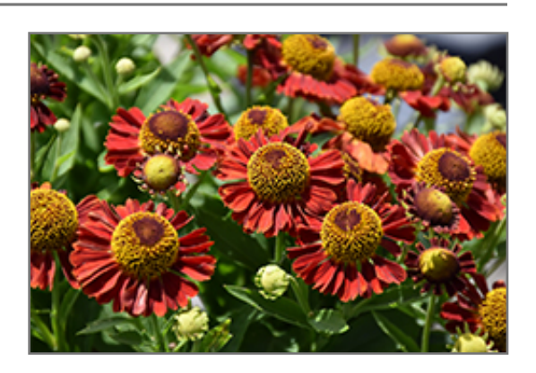
Mariachi Salsa Sneezeweed flowers