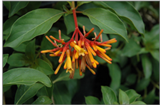
Dwarf Firebush flowers