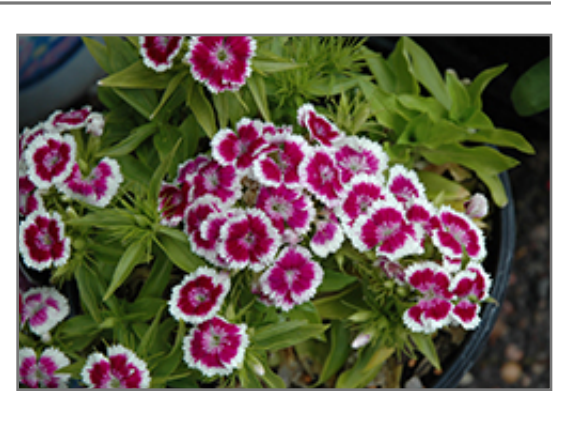
Barbarini Purple Picotee Sweet William flowers