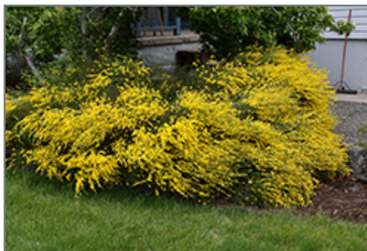
Spanish Gold Broom in bloom