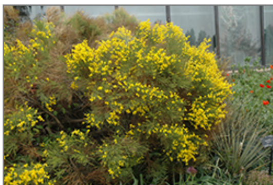
Spanish Broom in bloom