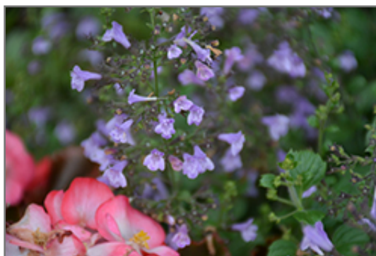
Marvelette Blue Dwarf Calamint flowers