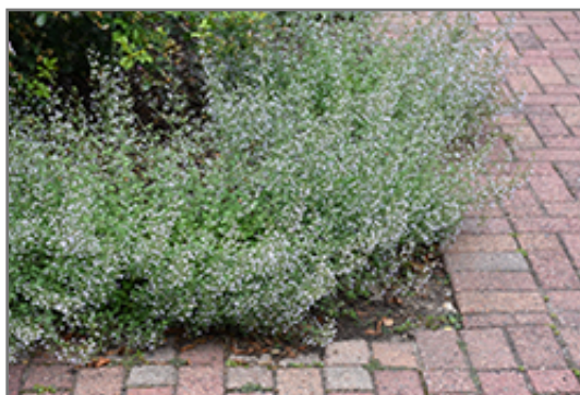
Blue Cloud Dwarf Calamint in bloom