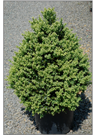
Alice Boxwood

Alice Boxwood will grow to be about 4 feet tall at maturity, with a spread of 3 feet. It tends to fill out right to the ground and therefore doesn't necessarily require facer plants in front. It grows at a medium rate, and under ideal conditions can be expected to live for approximately 30 years.