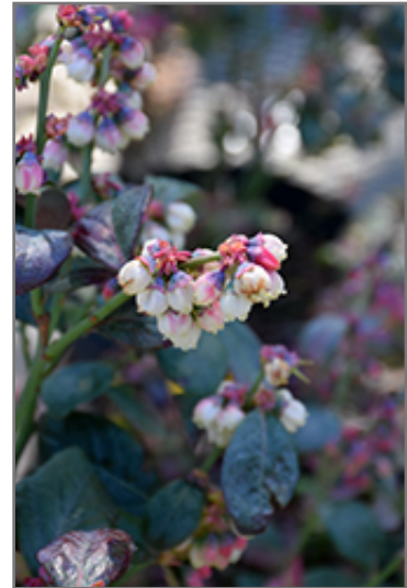
Pink Icing Blueberry flowers

This plant is not reliably hardy in our region, and certain restrictions may apply; contact the store for more information.