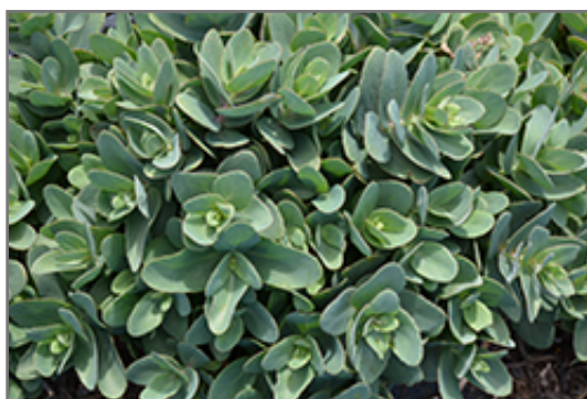
Rosetta Stonecrop foliage