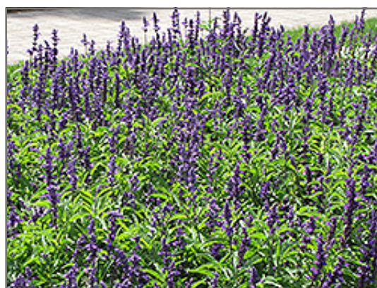
Gruppenblau Salvia in bloom