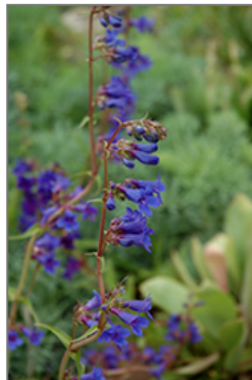
Grand Mesa Beard Tongue flowers

An outstanding variety with a tidy habit; brilliant blue flowers rising above green foliage makes a blazing visual impact when massed in the garden, along walkways, or in borders