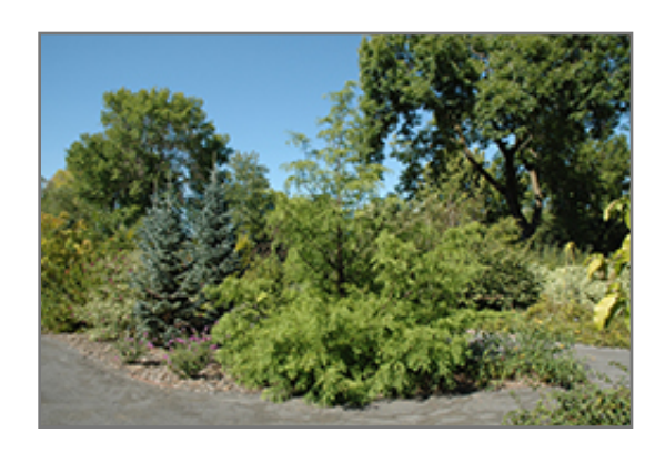
Spring Cream Dawn Redwood

Spring Cream Dawn Redwood will grow to be about 20 feet tall at maturity, with a spread of 15 feet. It has a low canopy, and is suitable for planting under power lines. It grows at a medium rate, and under ideal conditions can be expected to live for 50 years or more.