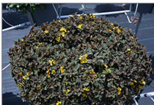
Midnight Sun Moneywort