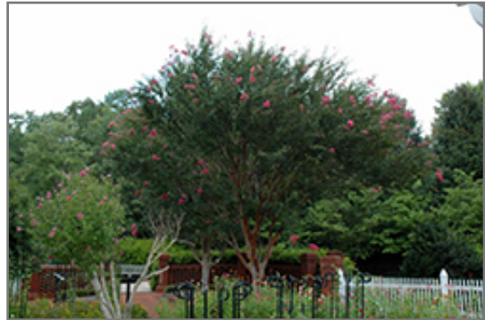
Watermelon Red Crapemyrtle in bloom

This plant is not reliably hardy in our region, and certain restrictions may apply; contact the store for more information.