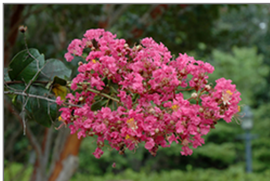
Watermelon Red Crapemyrtle flowers