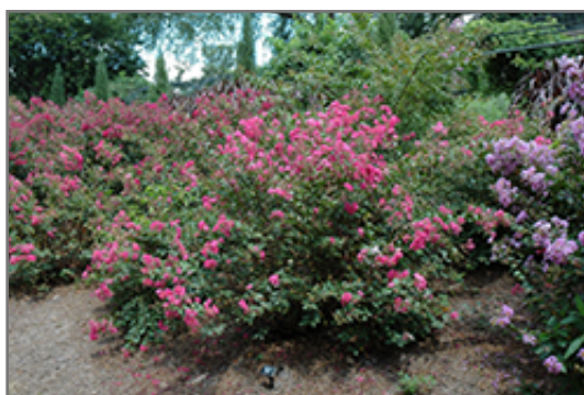
Bourbon Street Crapemyrtle in bloom