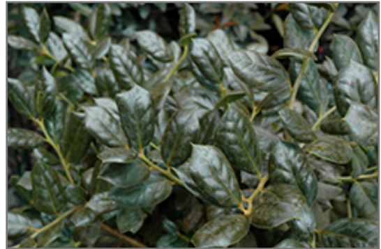
Burford Chinese Holly foliage

Burford Chinese Holly will grow to be about 15 feet tall at maturity, with a spread of 15 feet. It has a low canopy, and is suitable for planting under power lines. It grows at a medium rate, and under ideal conditions can be expected to live for 50 years or more.