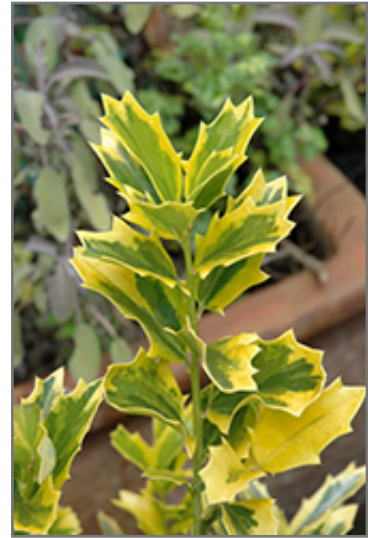
Oak Leaf Variegatd Holly foliage