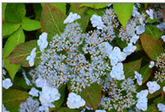
Tiny Tuff Stuff Hydrangea flowers

Tiny Tuff Stuff Hydrangea will grow to be about 24 inches tall at maturity, with a spread of 24 inches. It has a low canopy. It grows at a medium rate, and under ideal conditions can be expected to live for approximately 30 years.