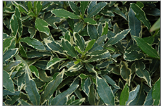
Variegated Radicans Gardenia foliage

Variegated Radicans Gardenia will grow to be about 12 inches tall at maturity, with a spread of 5 feet. It has a low canopy. It grows at a slow rate, and under ideal conditions can be expected to live for approximately 30 years.