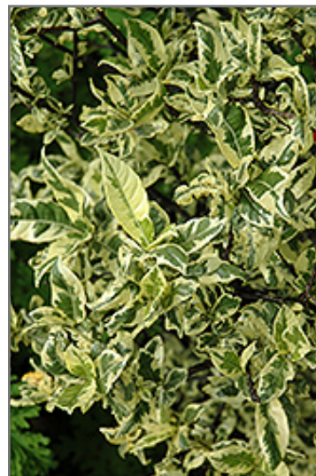
Mystery Variegated Gardenia foliage Photo courtesy of NetPS Plant Finder