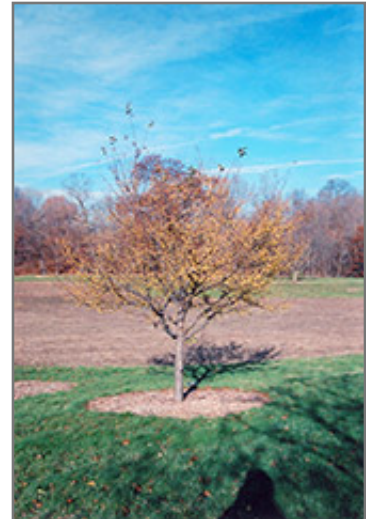
Winter Gold Flowering Crab fruit