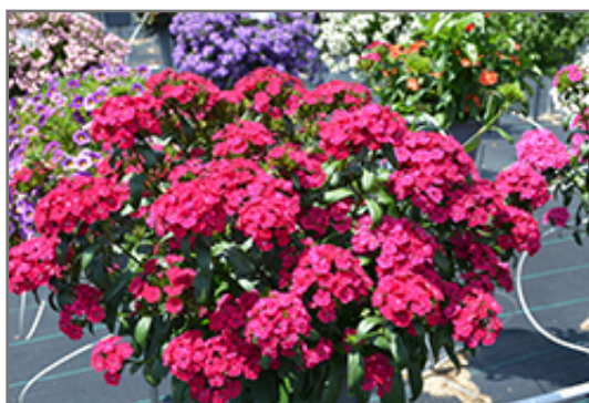
Jolt Cherry Hybrid Pinks in bloom