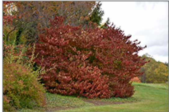
Doublefile Viburnum in fall

This plant is not reliably hardy in our region, and certain restrictions may apply; contact the store for more information.