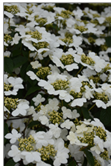
Doublefile Viburnum flowers