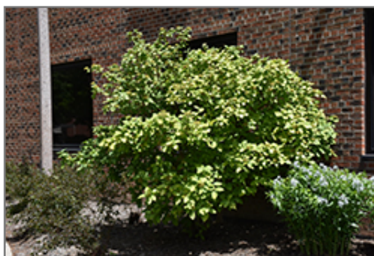
Golden Wayfaring Tree