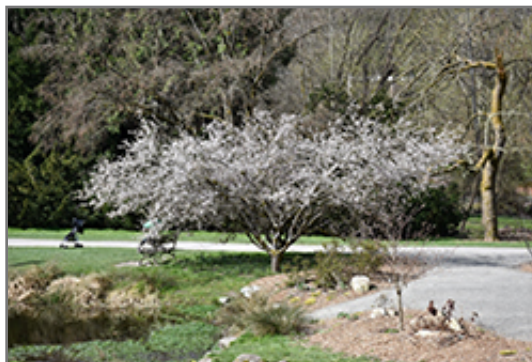
Fuji Cherry in bloom

Fuji Cherry is recommended for the following landscape applications;