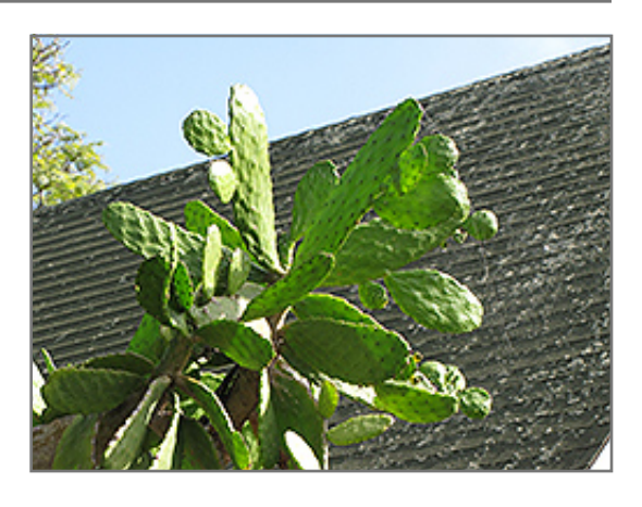
Road Kill Cactus foliage

Road Kill Cactus is a member of the cactus family, which are grown primarily for their characteristic shapes, their interesting features and textures, and their high tolerance for hot, dry growing environments. As an 'opuntiad' type of cactus, it doesn't actually have leaves, but rather modified succulent stems that comprise the bulk of the plant, and which are designed to retain water for long periods of time. This particular cactus is valued for its upright and spreading habit of growth on a plant consisting of spiny emerald green segmented pads that form 'branches' which spread out from a central base. This plant has yellow cup-shaped flowers at the ends of the branches in early summer, which are interesting on close inspection. It features an abundance of magnificent red berries from early to late fall.