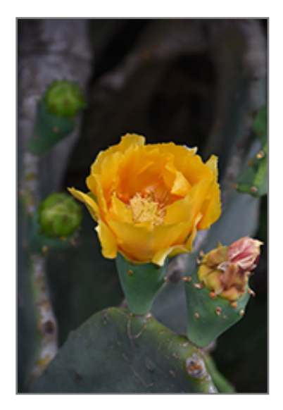
Barbary Fig flowers