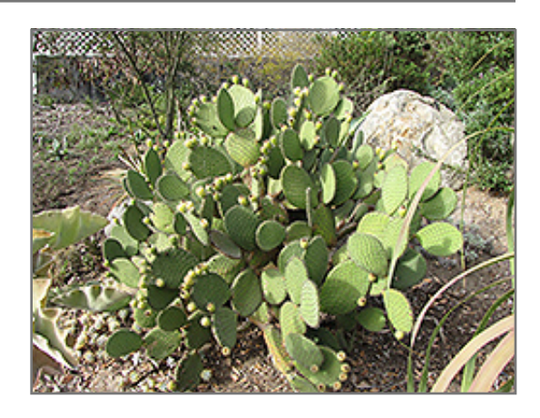
Barbary Fig

A domesticated crop variety producing edible fruits in late summer through early fall, following pretty yellow flowers in spring; exceptional as an accent for rock gardens and planters; needs perfect drainage and sandy or gravelly soils