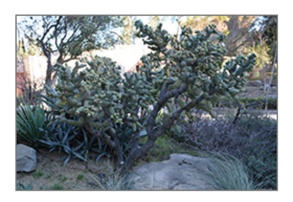
Cholla Cactus