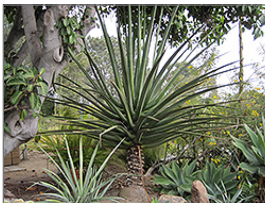
MacDougal's Century Plant