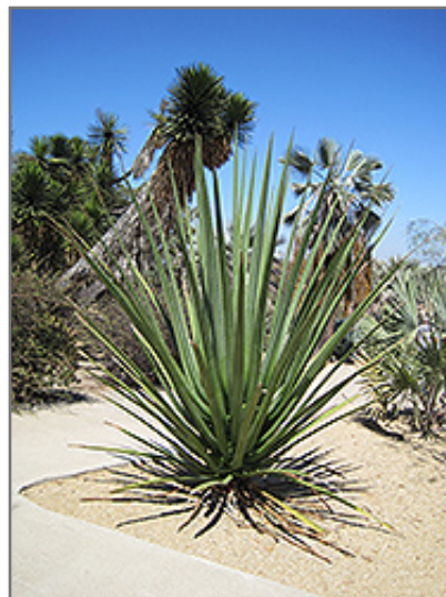
MacDougal's Century Plant

MacDougal's Century Plant is recommended for the following landscape applications;