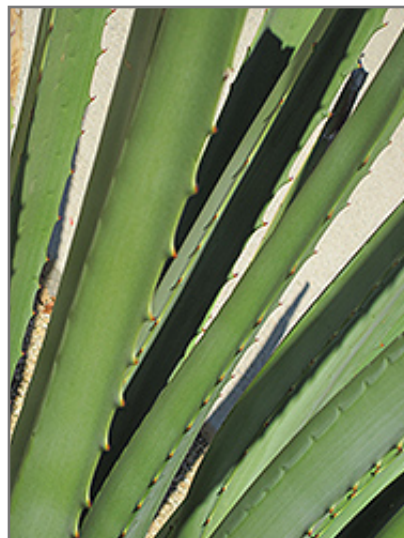
MacDougal's Century Plant foliage

This plant is not reliably hardy in our region, and certain restrictions may apply; contact the store for more information.