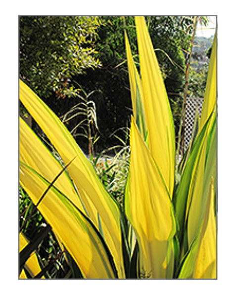
Mediopicta Mauritius Hemp foliage