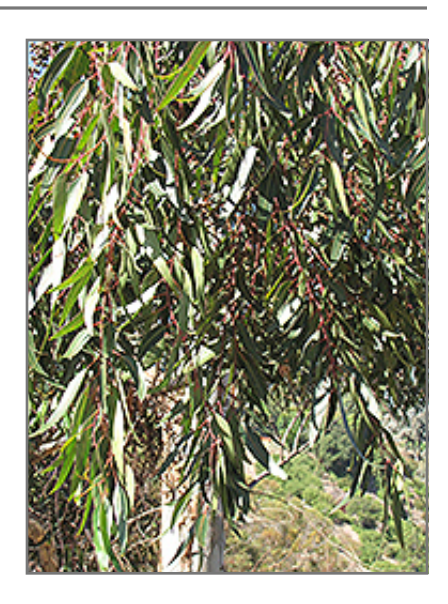
Narrow-Leaved Peppermint foliage

This tree should only be grown in full sunlight. It does best in average to evenly moist conditions, but will not tolerate standing water. It is particular about its soil conditions, with a strong preference for sandy, acidic soils, and is able to handle environmental salt. It is somewhat tolerant of urban pollution. This species is not originally from North America.