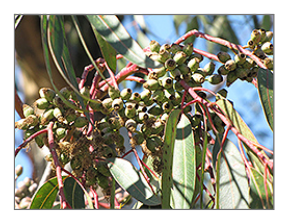
Narrow-Leaved Peppermint fruit