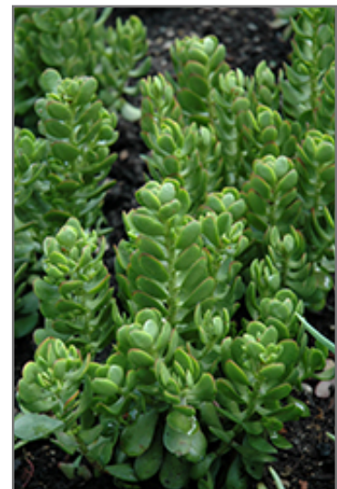
Red Carpet Stonecrop