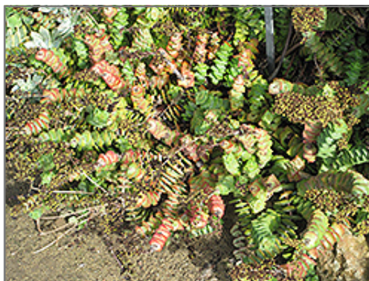
String Of Buttons

String Of Buttons is recommended for the following landscape applications;