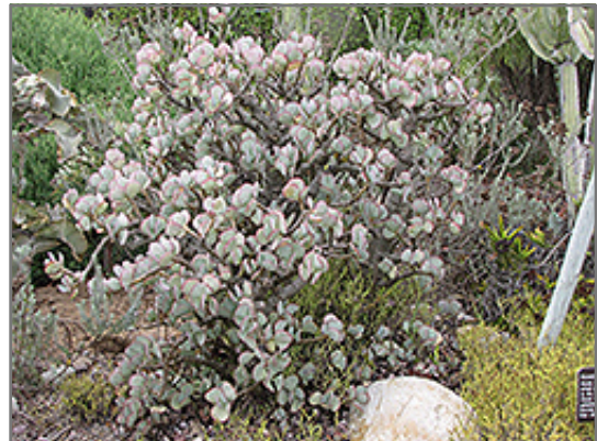
Silver Dollar Plant