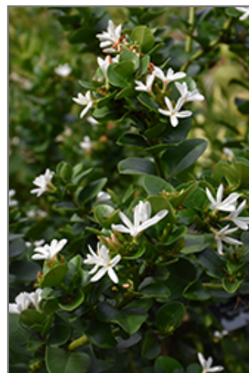
Natal Plum flowers

Natal Plum has attractive dark green evergreen foliage which emerges coppery-bronze in spring on a plant with an upright spreading habit of growth. The glossy round leaves are highly ornamental and remain dark green throughout the winter. It features dainty lightly-scented white star-shaped flowers along the branches from early spring to mid summer. It features an abundance of magnificent red berries from late spring to late fall.