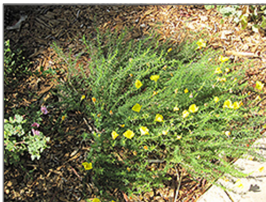
Hartweg's Sundrops in bloom