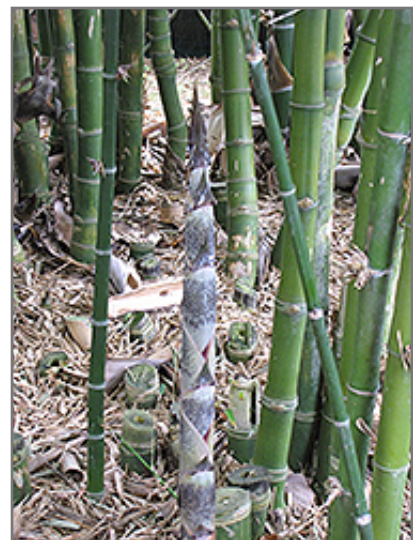
Narrow-Leaved Clumping Bamboo bark