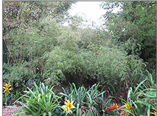
Narrow-Leaved Clumping Bamboo

This plant does best in full sun to partial shade. It does best in average to evenly moist conditions, but will not tolerate standing water. It is not particular as to soil type or pH. It is highly tolerant of urban pollution and will even thrive in inner city environments. Consider applying a thick mulch around the root zone in winter to protect it in exposed locations or colder microclimates. This species is not originally from North America. It can be propagated by division.