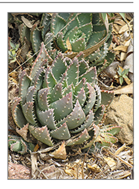
Short-leaved Aloe