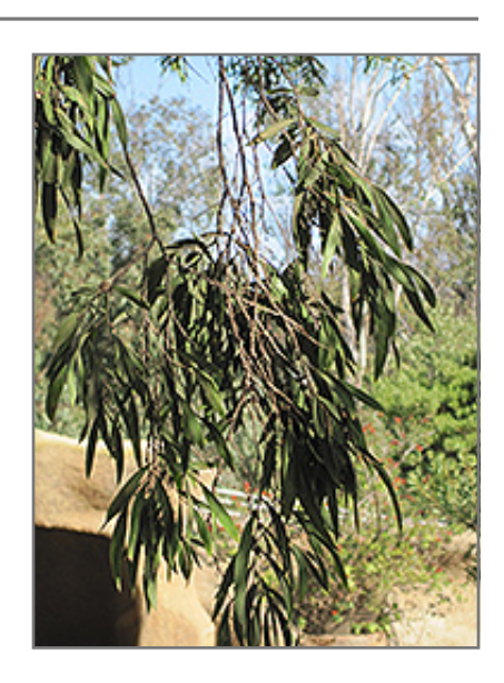
Peppermint Tree foliage

Peppermint Tree is a fine choice for the yard, but it is also a good selection for planting in outdoor pots and containers. Because of its height, it is often used as a 'thriller' in the 'spiller-thriller-filler' container combination; plant it near the center of the pot, surrounded by smaller plants and those that spill over the edges. It is even sizeable enough that it can be grown alone in a suitable container. Note that when grown in a container, it may not perform exactly as indicated on the tag - this is to be expected. Also note that when growing plants in outdoor containers and baskets, they may require more frequent waterings than they would in the yard or garden. Be aware that in our climate, most plants cannot be expected to survive the winter if left in containers outdoors, and this plant is no exception. Contact our experts for more information on how to protect it over the winter months.