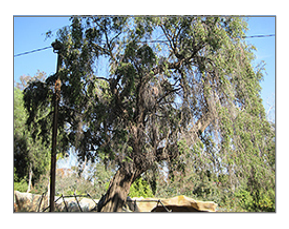
Peppermint Tree