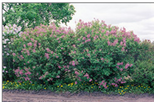
Saugeana Lilac in bloom