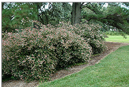
Glossy Abelia in bloom