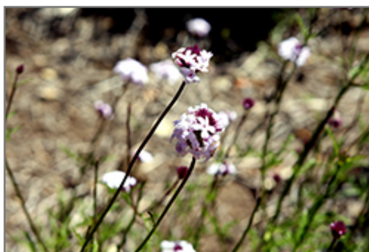
Lilac Verbena flowers