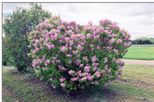
Hippolyte Maringer Lilac in bloom