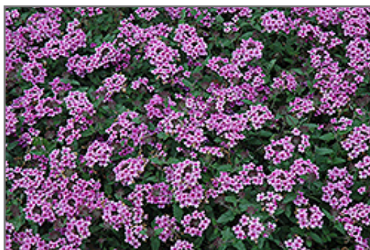
EnduraScape Lavender Verbena in bloom