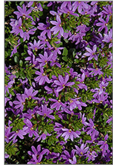
Brilliant Fan Flower flowers