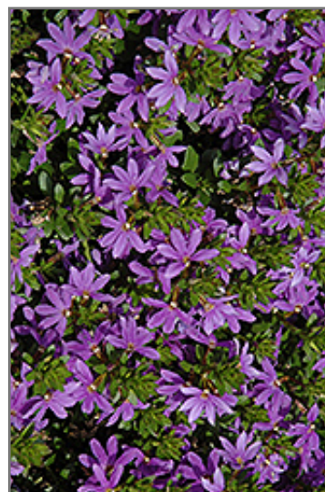
Brilliant Fan Flower flowers